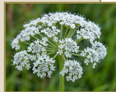
Poison hemlock has hollow finger-thick purple spotted stems and stands about 6-10' tall at maturity.