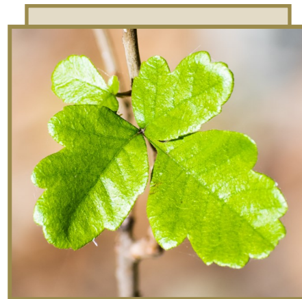
Poison oak leaves have leaflets with rounded edges that are not as shiny as poison ivy.

Controlling poison ivy requires a combination of identification, protective measures, and effective removal strategies. By understanding the plant's characteristics and using appropriate methods, you can minimize the risks associated with poison ivy and regain control over your environment. Remember to prioritize safety and when in doubt, seek professional assistance to ensure effective and long-lasting control.